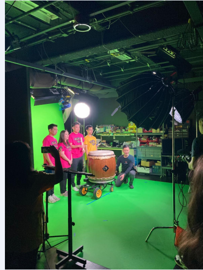
Photo caption: Members of San Jose Taiko at SCCOE headquarters partnering with the Digital Media team to film a segment of the pilot episode of TaikoTown.]

The pilot episode will be released online this month. Please click on the button below to access the new materials. We hope you and your kids enjoy these resources!